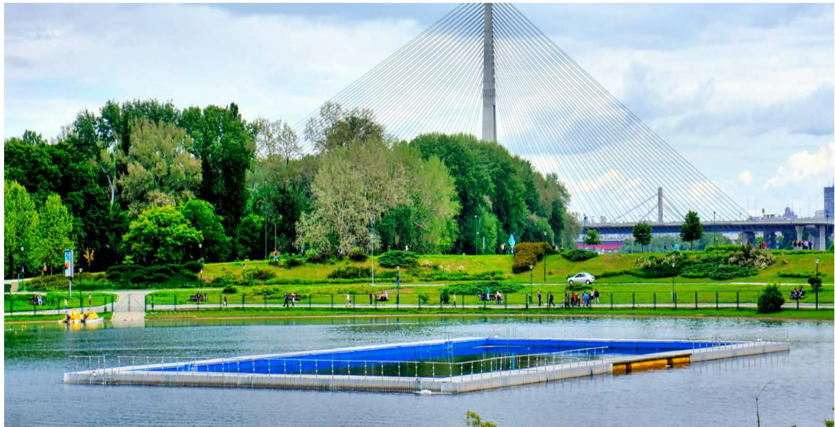
Figure 2. Promenade on Ciganlija river island with a view to The Ada Bridge in the background

The first criteria that is evaluated for the purpose of assessing benefits of the Belgrade region and its environment for recreation represent the length of the edge of forest. For this purpose was used Corine Land Cover database of landuse for the year 2012 [12], Figure 2. From total base (44 classes of land use) were singled out classes that include deciduous, coniferous and mixed forests, and then was calculated how many of these previously mentioned GRID cells contain edges of forests in meters.