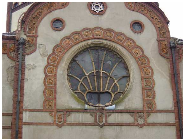
Figure 3. Detail of the north façade damaged by water (Authors photograph from 2000)