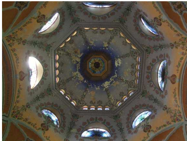
Figure 2. Interior of the synagogue dome displaying damaged layer of paint

“Standardprojekt”, led by the main engineer László Király, inspected static stability of the interior wire lath dome [3]. In 1988, apart from restoration works on the decoratively painted main dome of the Synagogue, both male and female toilets were built in the cellar area of the Synagogue, below the staircase leading to the gallery. After conclusion of the works, in February of 1989, the building was re-handed over to Subotica “National Theatre – Népszínház”. In the following period, the restoration of the Synagogue ceased once again, yet the efforts to move out the National Theatre from the building became more and more intense. In January 1991, representatives of the Inter-municipal Institute noted in the Synagogue a curtain which was scorched by a thermal accumulation heater. Thermal accumulation heating for the benefit of theatre performances also resulted in the increase of condensation within the restored dome and caused paint to peel off (Figure 2.).