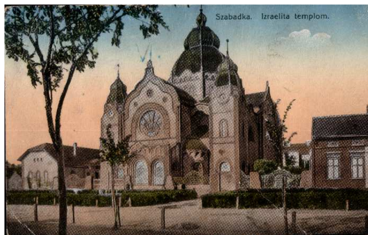
Figure 1. Synagogue at the beginning of the 20 th century

protected by the law as a cultural monument. Vojvodina Institute for the Protection of Cultural Monuments from Novi Sad adopted the decision to proclaim Subotica Synagogue a cultural monument [3]. Subsequently, the process of restoration and revitalization of Subotica Synagogue has commenced, and lasted to this very day.