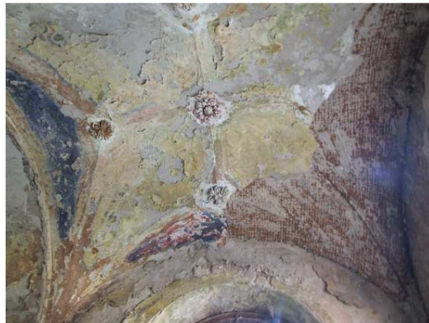
Figure 4. Damaged main entrance ceiling

In 2007 the works on reconstruction and restoration of the roof structure were initiated [3]. In June, representatives of the contractor "Subiro" filed a complaint against anonymous persons who, during the weekend of 2-4 June 2007, had stolen the copper rain gutters and drainpipes from the Synagogue building. During August of the same year, unknown persons removed majority of the brass ornaments from the previously restored central chandelier of the Synagogue, thereby inflicting great damage [20]. At the beginning of 2008, the chief designer Gabor Demeter made "Amendments to the Main Architectural and Structural Design for Reconstruction and Restoration of the Outer Layer of Subotica Synagogue" [3]. The works on reconstructing and restoring the roof lasted until December 2010. These works did not include the roof section above the main entrance of the Synagogue (Figure 4.), which was especially endangered by atmospheric water after the vertical drainpipes had been stolen, or the zinc covering of thesegmental domes on the Synagogue's corners. Thus, in mid-2011, representatives of the Inter-Municipal Institute requested that the funds be allocated for intervention works, in order for these sections of the roof to be restored too. Urgent intervention of repairing these defects was not undertaken until mid-2012.