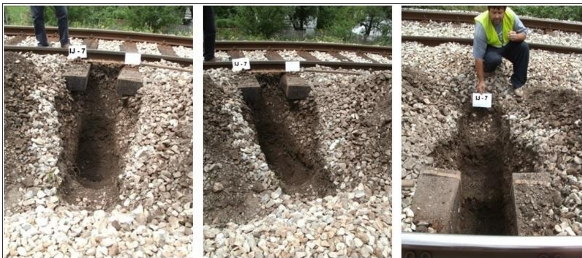
Figure 2a. Characteristic example of trench IJ – 7 on chainage km 105+450,00

Trenches were in detail mapped, photographed, figure 2a, and also were taken disturbed and undisturbed samples covered with the same material. Based on terrain mapping, results of laboratory tests, profiles of all trenches were made, figure 2b, as well as transverse profiles of the terrain along the route of the railroad.