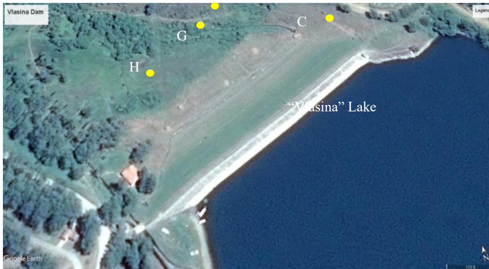
Figure 3 “Vlasina” dam and positions of pillars for dam monitoring

The practical value of air refraction influence on height differences determined by trigonometric levelling determination is in improvement of efficiency of dam monitoring. Actually trigonometric levelling method is more efficient than geometric levelling method and its utilization could increase efficiency i.e. to shorten the time of dam monitoring duration. At the same time the accuracy shall not be lost because the importance of reliable conclusion about state and behaviour of the dam.