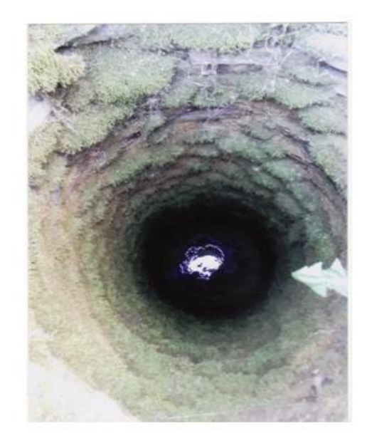
Figure 1. A shadoof well