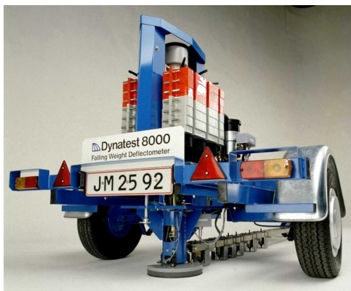
Figure 2. Dynatest 8000 FWD deflekcometer [9]

Data processing was performed using ELMOD 5.0 software package. Developed by Dynatest International A / S and uses an approximate method based on Boussinesq's Equations and Odemark's Equivalent Thickness Method for Estimating Layer Modules on the Deflection Database. Data processing, or "backcalculation", is based on the iterative procedure of calculating the modulus of pavement layers elasticity (figure 3).