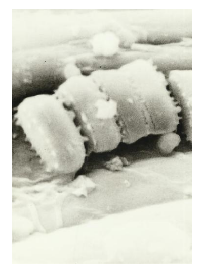
Figure 2. Navicula gallica var. gallica on moss leaves

Moss community, according to Grgić [41] was built exclusively from two types of moss: Oxyrrynchium praelongum (Hedw.) Wstf. and Platyhypnidium rusciforme Fleischr. These moss associations of well wall are inhabited by diatoms which frequently build colonies or aggregates in the way of stripes, and are especially visible with scanning electron microscope. For example, Navicula gallica var. gallica, of very interesting ornament, best illustrates colonial shapes of Naviculaceae family on moss leaves (Figure 2).