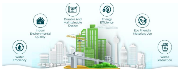
Figure 2. Sustainable Construction: Methods and Benefits [13]

A number of green building materials and technologies have evolved over the last few years in response to sustainable construction goals. In this paper, only the most promising, cost-effective, and reliable materials and technologies are discussed. In this context, green does not refer to a greenish color or material, as in ecological or natural material, nor does it mean a thing made out of plant or wood. Instead, it refers to either renewable and/or recyclable, resource-efficient, less harmful, more energy-efficient, or manufactured in ways that protect the health of workers as well as building occupants. Moreover, green may also mean durable and long-lasting, and thus sustainable. Green may also mean appropriate for contextual or ethical reasons, and fitting well in the community and landscape in terms of use and image. In summary, green building material means one that reduces or eliminates harmful environmental impact, reduces the use of non-renewable resources, and/or reduces the generation of waste. In figure 2 shows the Sustainable Construction methods and benefits.