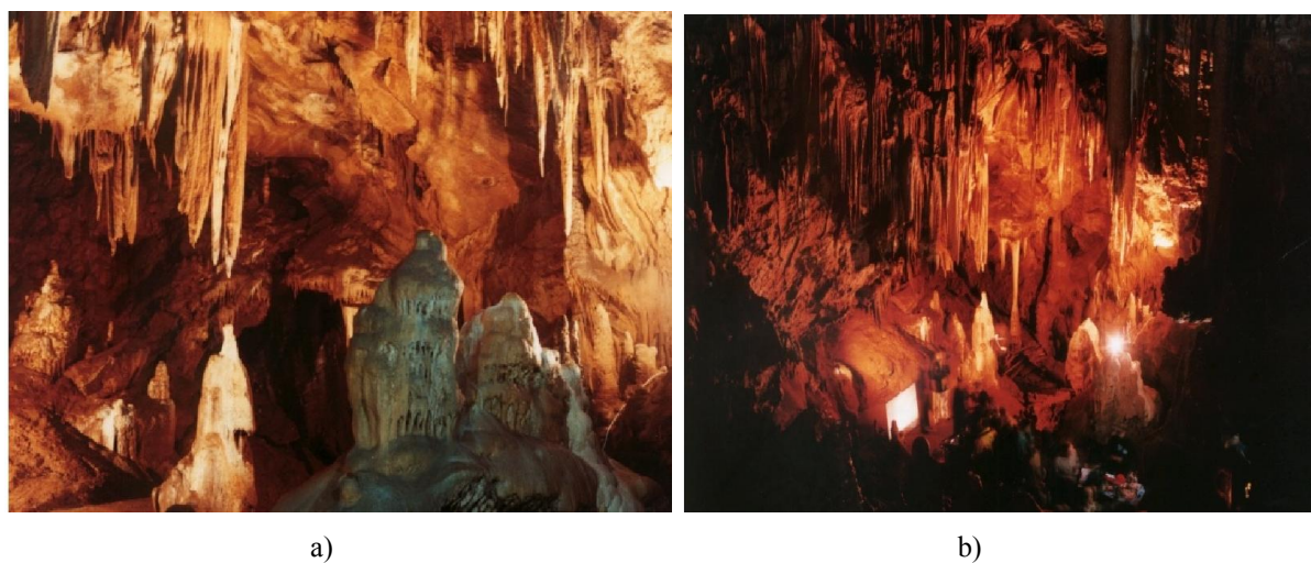
Figure 2 The interior of the cave Orlovaca a) speleothems in Romanija chamber, b) Galerija and Romanija chambers

The aesthetic value of this object enhancing and enriching beautiful draperies provide the perfect ambience design. Basins of different sizes filled with water, provide a complete inventory of the cave ornaments. In addition to the cave ornaments, special tourist motive in caves are underground streams, rivers, lakes, rare forms of cave flora. For these reasons, Orlovača cave is one of the largest and most beautiful cave system in Bosnia and Herzegovina and Republic of Srpska.