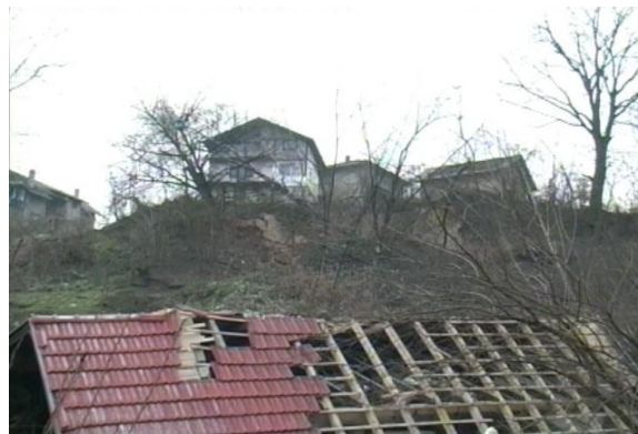
Figure 2 Landslide "Crvene njive" in Tuzla, Bosnia and Herzegovina.

The depth of the landslide is 10-12 meters and is related to the depth of burial clay layer that lies beneath the sand, figure 2.