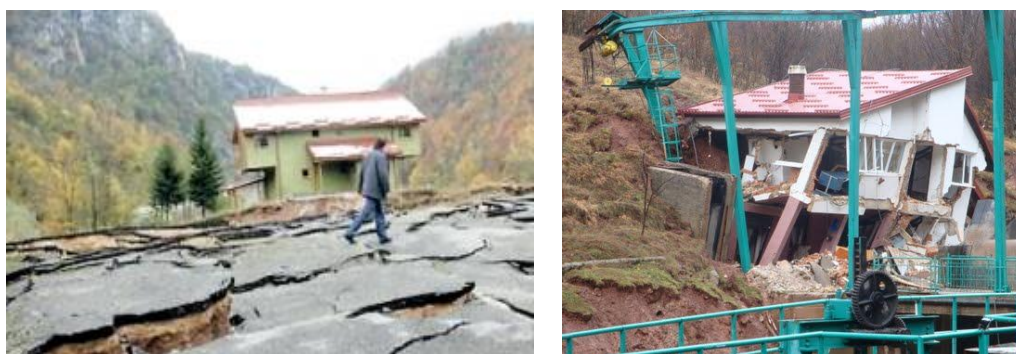
Figure 3 Landslide in Bogatići, Municipality Trnovo – Bosnia and Herzegovina

Landslides negatively influence on morphology of surface of area and it can be seen in examples of landslides in Suljaković near Maglaj and Bogatići at Trnovo [5]. One example of impact of landslides on forest vegetation is also landslide in Bogatići at Trnovo, which represents the largest and fastest landslide, figure 3.