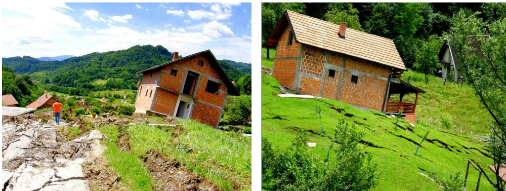
Figure 4 Demolition of houses in Suljaković, Municipality Maglaj – Bosnia and Herzegovina

Landslides negatively influence on morphology of surface of area and it can be seen in examples of landslides in Bogatići at Trnovo and also Suljaković near Maglaj [6]. According to the scale and catastrophic consequences, this landslide is one of the largest in BiH. During the construction of the M-17 there was already a landslide, which was then repaired. Landslide is certainly formed after recent rains. During the construction of houses, these were buried streams which are on the left and right sides of landslides. These streams were dragging surface water. Another cause is illegal construction. Cutting the slope at upper side of facilities, including leveling and filling from lower side, resulting imbalance of mass, disturb is natural balance conditions and then worst happens, figure 4.